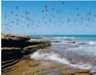
The tide rushes in at Ras ar Ruways, north of Masirah