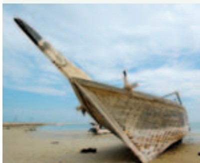
A dhow near Sur, south of Qalhat