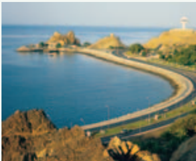
Waterfront curves around the corniche