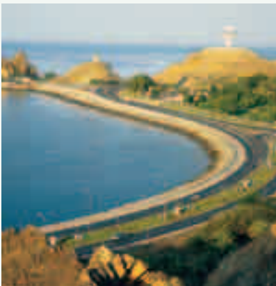
Waterfront curves around the corniche