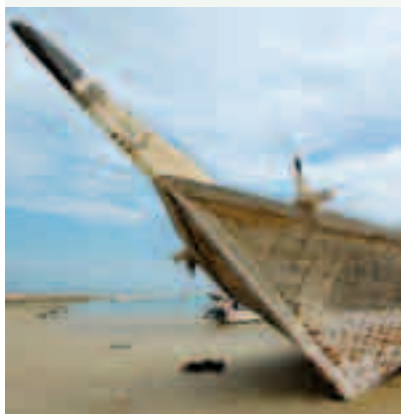
A dhow near Sur, south of Qalhat