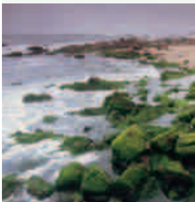
The wild shores of Hasik, east of Salalah