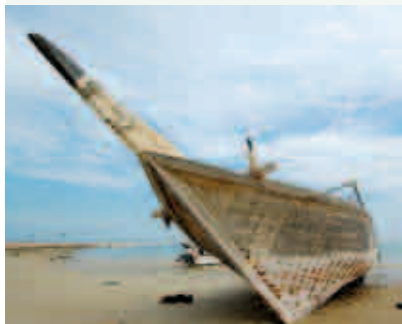
A dhow near Sur, south of Qalhat