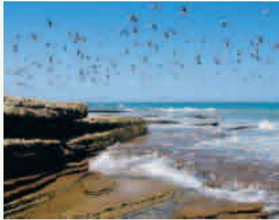
The tide rushes in at Ras ar Ruways, north of Masirah