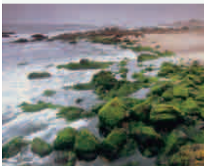
The wild shores of Hasik, east of Salalah