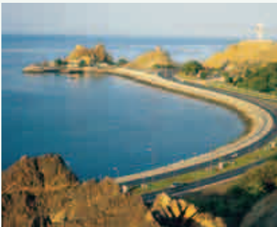
Waterfront curves around the corniche